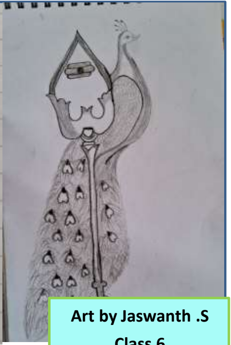
Art by Jaswanth .S Class 6