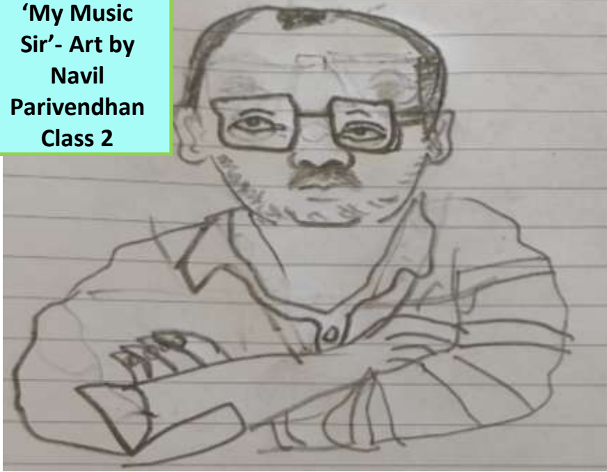
'My Music Sir'- Art by Navil Parivendhan Class 2