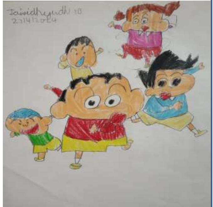
Jaividhyudh III B